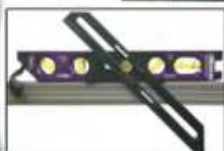
Level Not Included