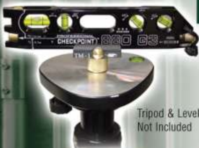
Tripod & Level Not Included