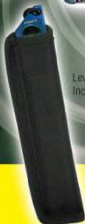
Level Not Included