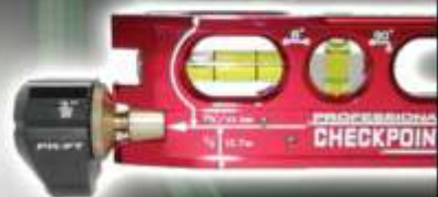
Level Not Included