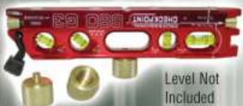
Level Not Included