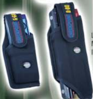
Levels Not Included